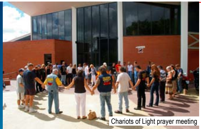
Chariots of Light prayer meeting

was not to star on the track, but to own an automotive business. “I remember my dad constantly telling me this was a hard way to earn a living and that I should get an education,” he remembers. “I didn’t want to disappoint him, so I did.” In 1964, he went to college—acquiring a young college man’s problems with alcohol and gambling—which he says often conflicted with his Christian upbringing.